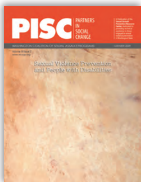
Volume XII Issue 2 Sexual Violence Prevention and People with Disabilities

The Prevention Resource Center is a project of WCSAP, designed to provide support and technical assistance to individuals, communities and agencies engaged in sexual violence prevention within Washington State.