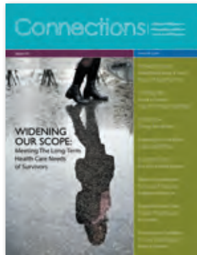
WIDENING OUR SCOPE: Meeting The Long-Term Health Care Needs of Survivors

The Mission of the Washington Coalition of Sexual Assault Programs is to unite agencies engaged in the elimination of sexual violence through education, advocacy, victim services and social change.