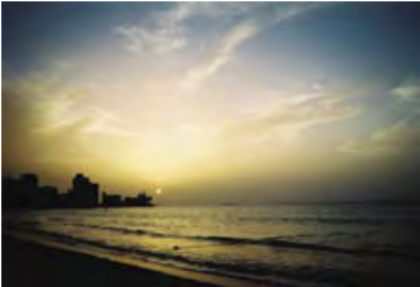
The shores of San Jaun, Puerto Rico.