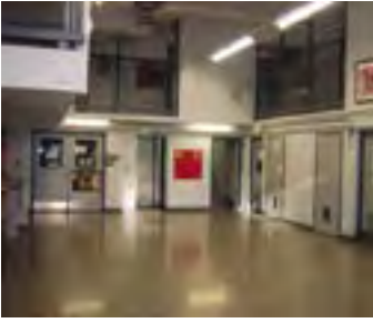
Matsqui Institute, Canada

“I decided to take a trip to Canada to not only see how they started their program, but to also speak with staff and go inside one of their prisons.”