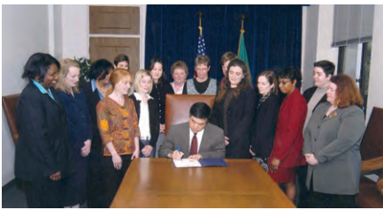
2004 SAAW PROCLAMATION SIGNING BY FORMER GOVERNOR LOCKE

This year's theme, "One State of Mind Can END Sexual Violence" speaks to broader communities in participating in solutions to preventing sexual violence. "Every two minutes, someone somewhere in America is raped." This is not just a women's issue; this is a human issue. This is a global issue. The purpose of our campaign is to engage individuals, communities, and organizations to take a vocal and active stand against sexual violence.