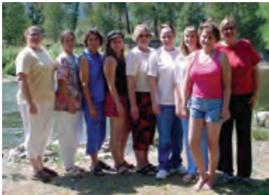
Connections Staff at 2004 Annual Retreat, Republic, WA

"Our foundation in the work of sexual assault and violence prevention is being the voice that can speak when others are unable. In the education department at KCSARC, it is the base from which we build all our prevention efforts, the old and the new."