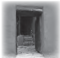
VOLUME IX ISSUE 2

The Prevention Resource Center is a project of WCSAP, designed to provide support and technical assistance to individuals, communities and agencies engaged in sexual violence prevention within Washington State.